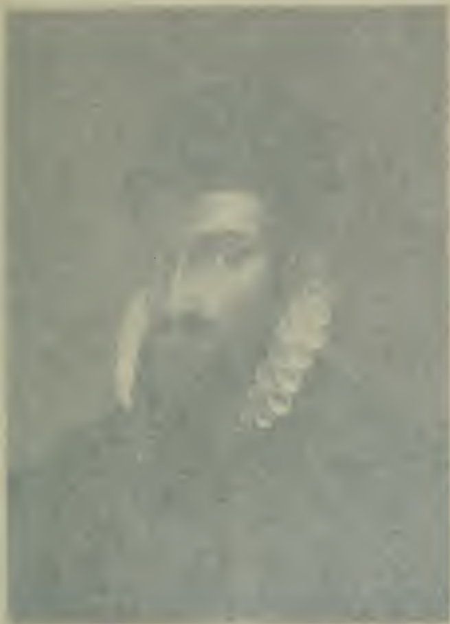
PORTRAIT OF FRANCISCO PIZARRO